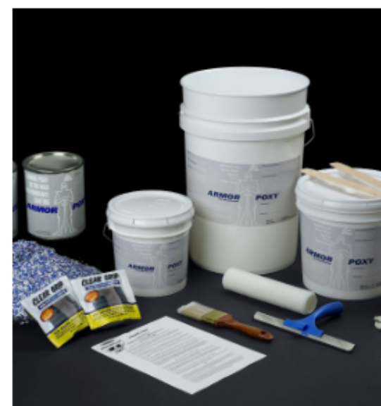
ArmorUltra ArmorTallc 300 Sq Ft. | Metallic Epoxy | Complete Floor kit 100% Solids