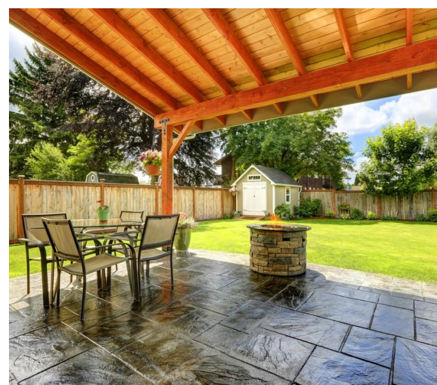
Semi-Clear Membrane applied to a gray patio

There is almost no application that cannot be fixed with ArmorPoxy's Armor Liquid Membrane! This product can stretch up to 300% without tearing, and bridge small cracks without issue. Larger cracks can be filled with our fabric reinforcement (pictured above) alone or with a combination mixed with sand to create a flexible slurry patch.