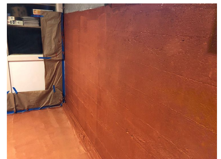
Orange Membrane painted onto a concrete wall

Armor Liquid Membrane is available in 14 colors. Coverage on porous surfaces is 100-150 square feet per coat. Coverage on non-porous surfaces is 200-250 square feet per coat.