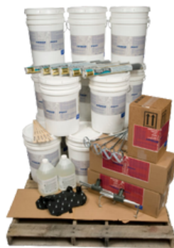
Job on a Pallet Epoxy System