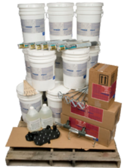
Job On a Pallet Epoxy System

Red Clay used ArmorPoxy's ArmorUltra Job, a three-layer epoxy system, for the application on a pallet. The industrial grade epoxy system provided all the necessary materials for the floor installation, allowing the crew hired to execute the project successfully.